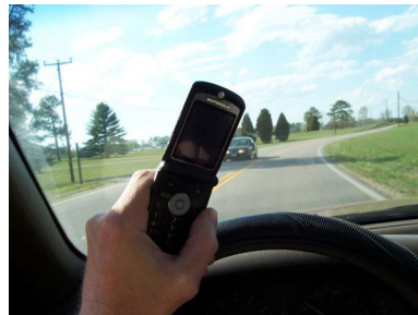
Cell Phones and Driving

emergency services agency. The base fine for the FIRST offense is $20 and $50 for subsequent convictions. With the addition of penalty assessments, the